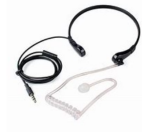
Airtube Earpiece With UmpireTalk adapter

Acoustic air tube earpiece with cable to connect to UmpireTalk radio