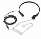
Airtube Earpiece With Interphone adapter

Acoustic air tube earpiece with 3.5mm OMTP cable for use with interphone radios